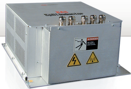
Figure 2: The redundant anode sputtering (RAS) Split Inductor

AC dual-magnetron sputtering (DMS) has been a well known technique for more than 15 years. The need for long-term, stable deposition of insulating materials motivated the introduction of this technology into the industry. Even for the deposition of highly insulating materials like SiO 2 or Al 2 O 3 , this technique can achieve high deposition rates, good process stability, and high uniformity.